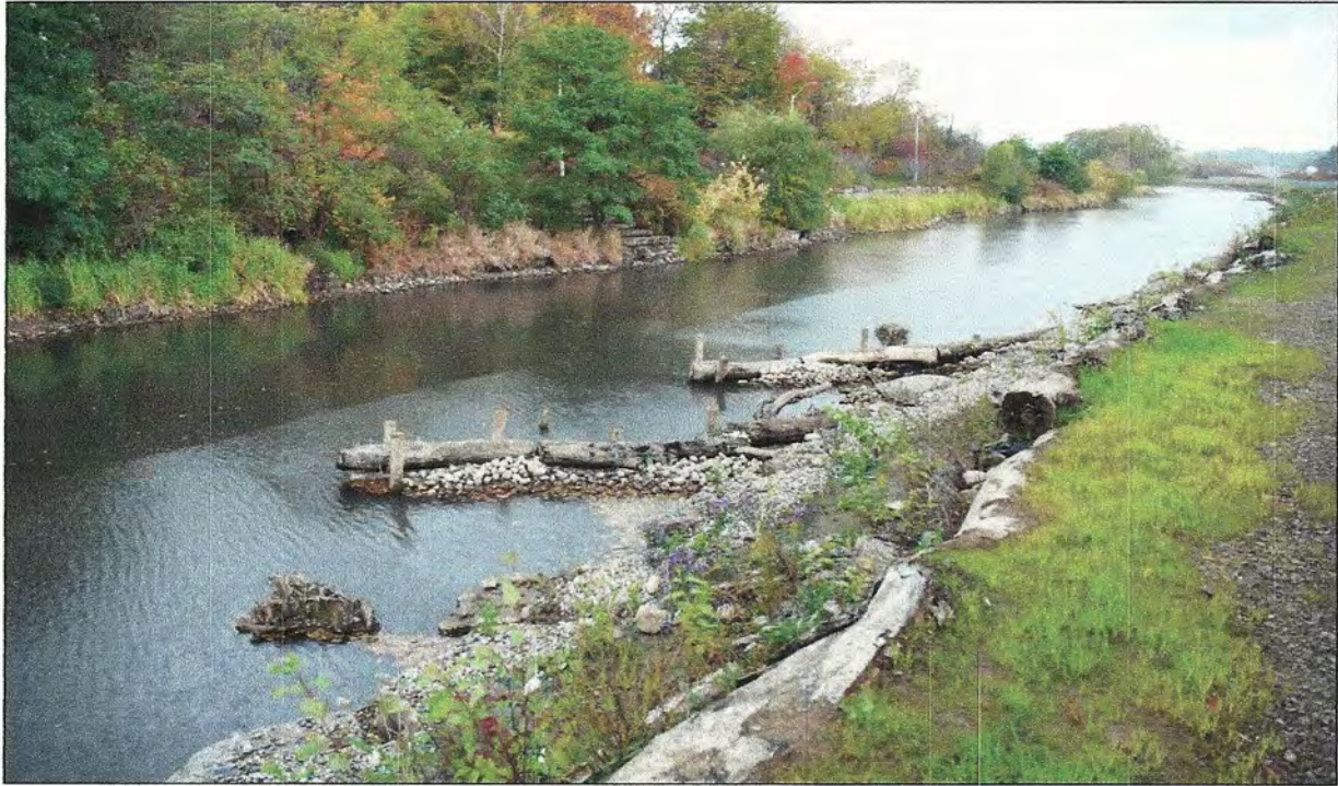
Figure 5: Completed bank stabilization; live crib wall beginning to grow atop LCS with log vanes as habitat enhancement in the creek channel.