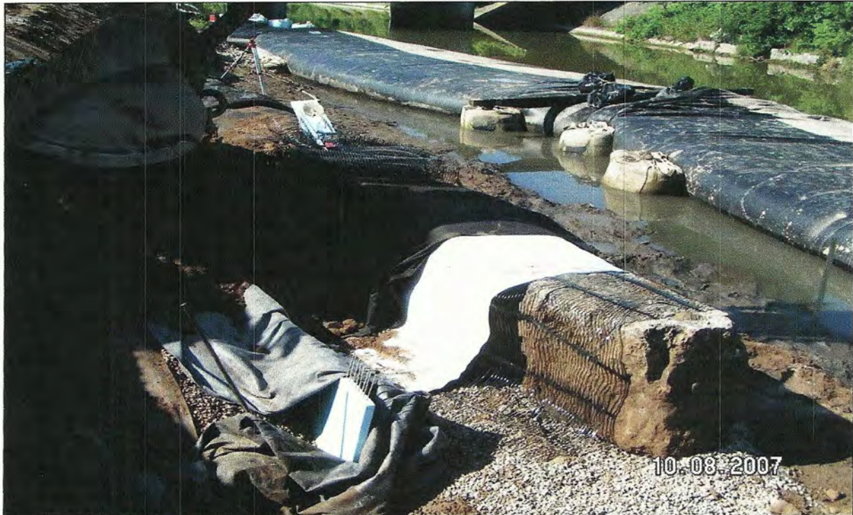
Figure 3: LCS with GCL membrane, Geogrid in reconstructed bank of armourstone (AquaDam™ flexible coffer dam system used to isolate work area from creek in background).