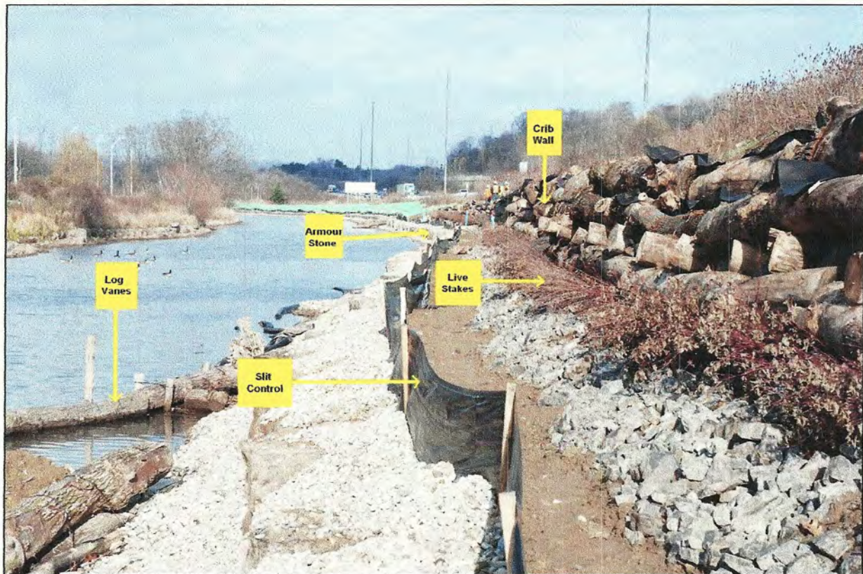
Figure 4: Crib wall placed atop LCS to stabilize bank in conjunction with armour stone. Log vanes are a habitat enhancement.